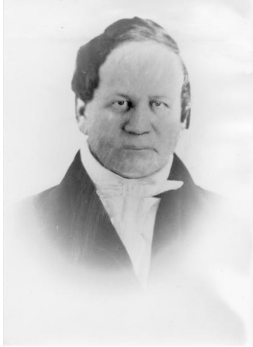
Photo 1 Alexander Twilight

Promoters of free black removal from the United States to Africa (or what they termed colonization) welcomed the emigration of Jones, who helped found Sierra Leone's first Western colonial college, and Russwurm, who became a school superintendent in Liberia. Quite a few of the early black graduates and educators were accommodating separatists . They bowed to the relatively conservative dictates of the day that posed black emigration to Africa as the solution to the slave-holding society's racial quandary: what to do with free blacks. These early accommodating separatists were imbued by their paternal Pan-Africanism, a belief that African Americans should impart their "superior" civilization to "backward" Africans. Their educational benefactors were often the American Colonization Society (ACS). Slaveholders desiring the ejection of free blacks, Christians distressed with Africa's "pagans," and those who believed emigration must follow black emancipation—the "colonizationists," as Carter G. Woodson termed them—were an antebellum force. 3