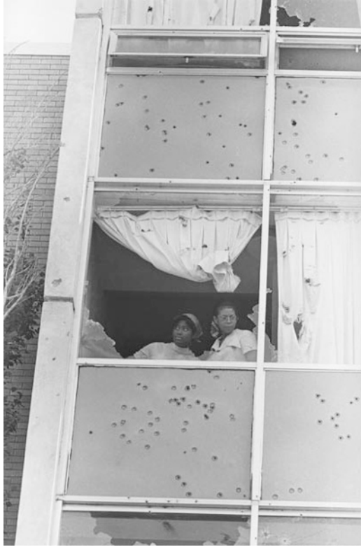
Photo 8 Two students at Jackson State peer from a dormitory window that was shot out by police on campus, May 15, 1970

whites on Lynch Street, a major Jackson thoroughfare that ran through campus. The disruption intensified. Just as on the night before, the Jackson police and state patrolmen, many of whom were known Klansmen, stormed onto the campus with the order to “go in there and scatter them damn—those Negroes.” In addition, a Jackson lieutenant assembled a group of officers to disperse more than one hundred students in front of a women’s dormitory, Alexander Hall, on Lynch Street. It was about midnight, and some of the female students had just entered the dorms before curfew, after being escorted by their male friends, who were still milling around. The lawmen stopped in front of the dorm. “You white pigs!” “White sons-of-bitches!” The students were irate at the police presence. A bottle smashed loudly into the Lynch Street pavement in front of the frightened officers. “They’re gonna shoot!” a student screamed.