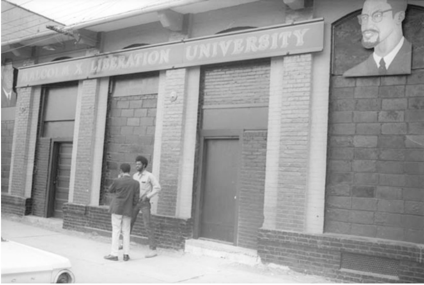
Photo 7 Howard Fuller talking to a student in front of Malcolm X Liberation University, October 1969

Nevertheless, the staffing boom had its downside. HWCUs amplified their raiding of HBCUs for professors, leading to massive turnover. Miles in Birmingham, for instance, with a faculty of sixty-one in 1969, had to replace forty-five teachers the previous three years. “Every black Ph.D. who has his name mentioned twice, or has published in the slightest review, is besieged by Northern as well as Southern white institutions—most often in response to militant, urgent and often threatening demands by their black students,” Spelman history chairman Vincent Harding explained to the New York Times in 1969. 34