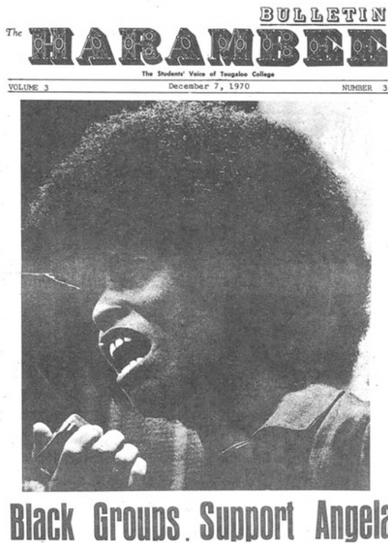
Photo 6 Front cover of The Harambee at Tougaloo College (MS) on December 7, 1970

commitment is to his people,” and a true Black University would produce this type of student. HBCU students left with a clear concept of a “Black University.” One Fayetteville State (NC) student attendee explained to his campus community that the concept “emerges out of the frustrations of” African Americans “who recognize that the present institutions of higher learning have no relevance to the total Black community.” Over the next few years, black student conferences were held at institutions such as Augustana-C in Illinois, Stanford, Jackson State, Princeton, UTEP, and the Universities of Minnesota, Oklahoma, North Dakota, Missouri, and South Carolina. 49