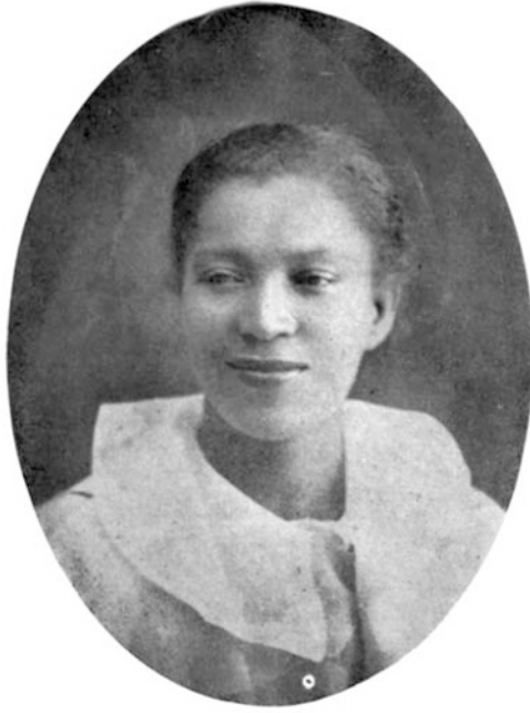
Photo 3 Zora Neale Hurston at Howard

to a better life into the pot. Many of the 400,000 or more black men who served in World War I injected into the pot their fighting spirit, a sense of urgency, the taste of interracial activity, and the seasonings of change, as did first-wave feminists and clubwomen. The self-determination slogans of President Woodrow Wilson were thrust into the pot, along with the parallel ideas emerging from the Russian Revolution in 1917. Scholars and artists accelerated their striving in African American self-discovery, self-examination, and self-inventiveness. African Americans downgraded political accommodation, cultural assimilation, and reverence of whiteness, allowing another ideology to rise in its place. The mood, then conviction, became encapsulated in two words: New Negro. 19