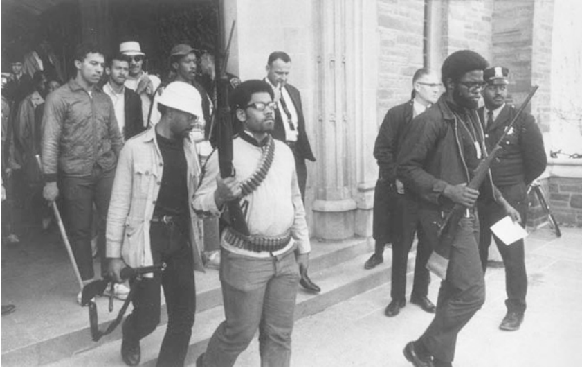
Photo 9 Heavily armed African American students leave Straight Hall at Cornell on April 20, 1969

the next few hours, while a stream of telephone reports about copycat invaders unnerved them, AAS members smuggled guns into the hall for protection. What was planned as a festive, peaceful, and brief building takeover became an extended, apprehensive, and vehement seizure. DU students pushed Cornell student opinion behind the AAS occupiers, who in the early afternoon issued four demands: nullify the three reprimands, reopen the question of housing, and conduct thorough investigations of the cross burning and the DU attack.